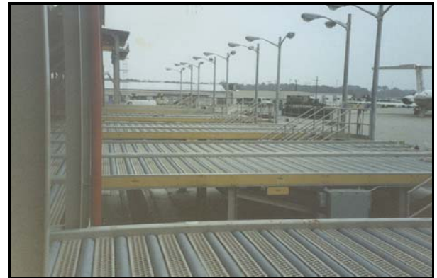
Powered Roller Decks

Webb-Stiles Air Cargo Conveyors are in use by many air cargo customers, including the U. S. Air Force and Naval Defense Departments.